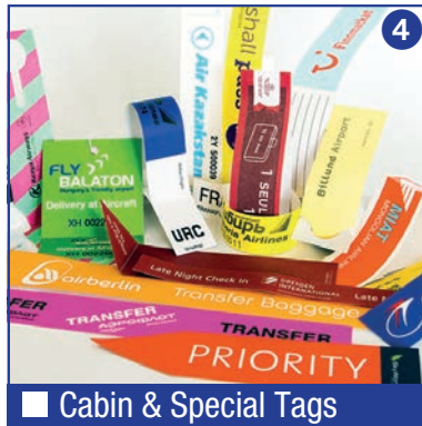
■ Cabin & Special Tags