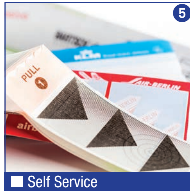
■ Self Service