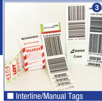
■ Interline/Manual Tags