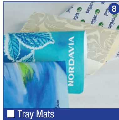
■ Tray Mats