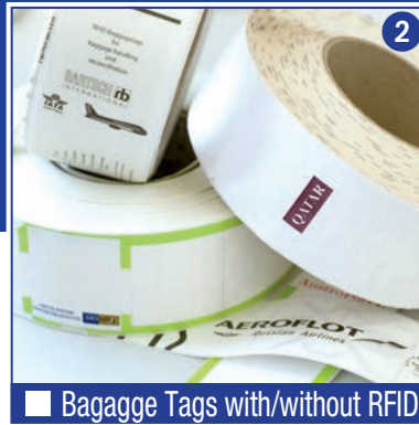
■ Baggage Tags with/without RFID