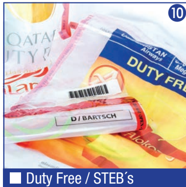
■ Duty Free / STEB's