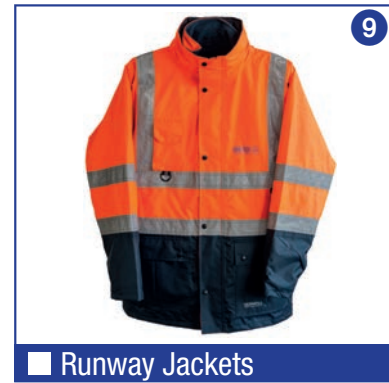
■ Runway Jackets