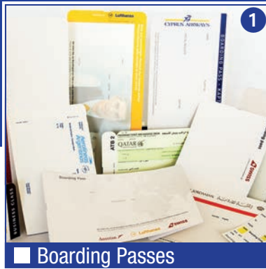
■ Boarding Passes

Your competent supplier for Airline-Equipment