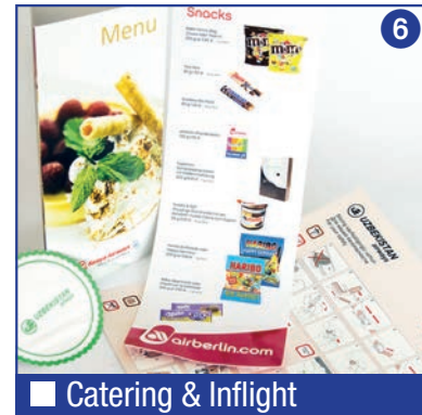
■ Catering & Inflight