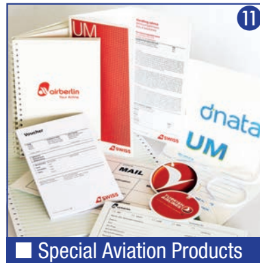
■ Special Aviation Products